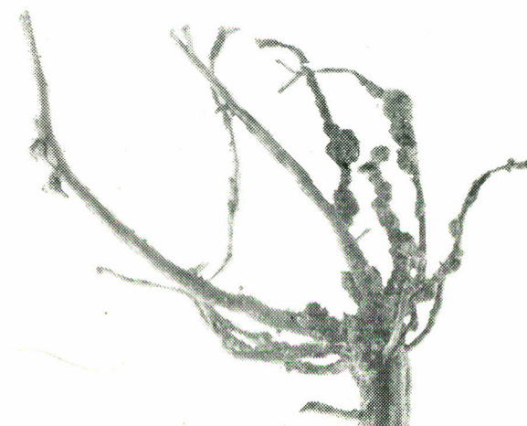
Fig. 2. Dolichos lablab