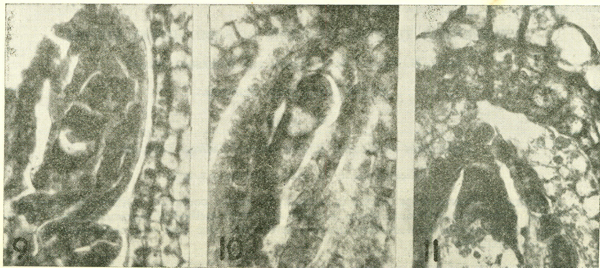
Fig. 9. A triad of megaspores. Fig. 10. Photomicrograph of binucleate embryo sac. Fig. 11. The multilayered outer integument at the micropylar end.

rate. The degeneration begins with the micropylar spore and proceeds progressively downwards (Fig. 5).