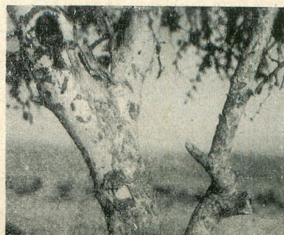
Fig. 1.—Gum arabic tears formed along the upper and lower ends of the cut.

It is a small thorny tree belonging to the family Leguminosae and sub-family Mimosoideae . It reaches a height of 20 feet and girth of 2 feet.